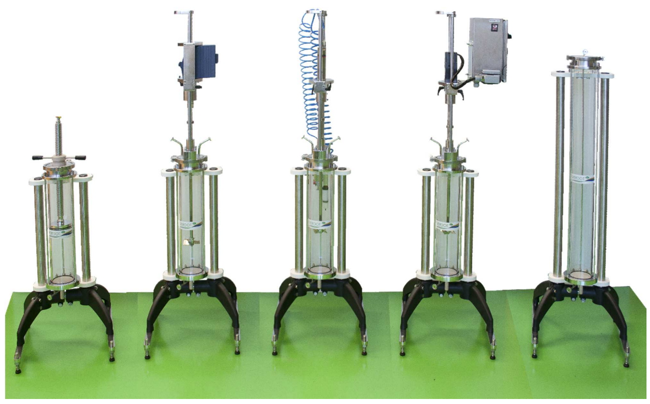
The PilMod D100 mm configurations